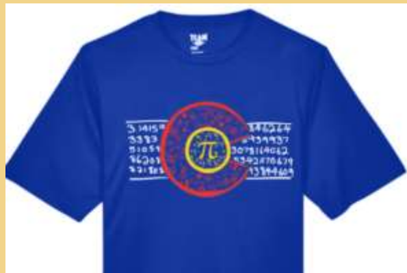
2023 TCA Pi Day T-Shirt